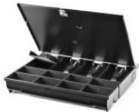
HP Standard Duty Till Insert with lockable lid (Part # QT458AA)