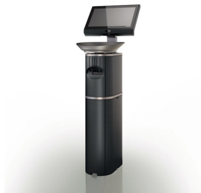
MC 500 stand-alone model

The 15.6" color touch display offers shoppers clarity plus optimum comfort and convenience of use: in terms of intuitive product selection, transparent provision of information about the food products and the display of advertisements and promotional videos in brilliant image quality. To keep the MC 500 continuously available for service, the optional PaperNearEnd function issues a timely alert when the paper in the printer is running out. The storage space integrated in the stand facilitates fast and simple replacement of the label rolls. The rolls, along with cleaning agents, can be comfortably stored in the space provided and are accessible from both sides. Time can also be saved during the daily cleaning activities thanks to the Easy Clean housing.