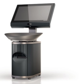
MC 500 table-top model